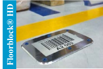
Floorblock ® HD